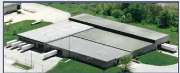
One of multiple Hammond Distribution Centers